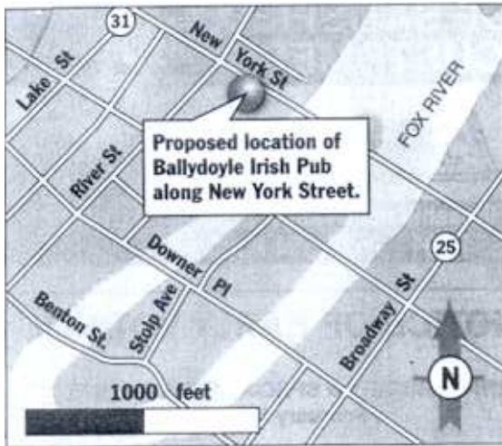
ILLUSTRATION BY SHAWN VILAND / STAFF ARTIST

Buildings would house entertainment venue along New York Street